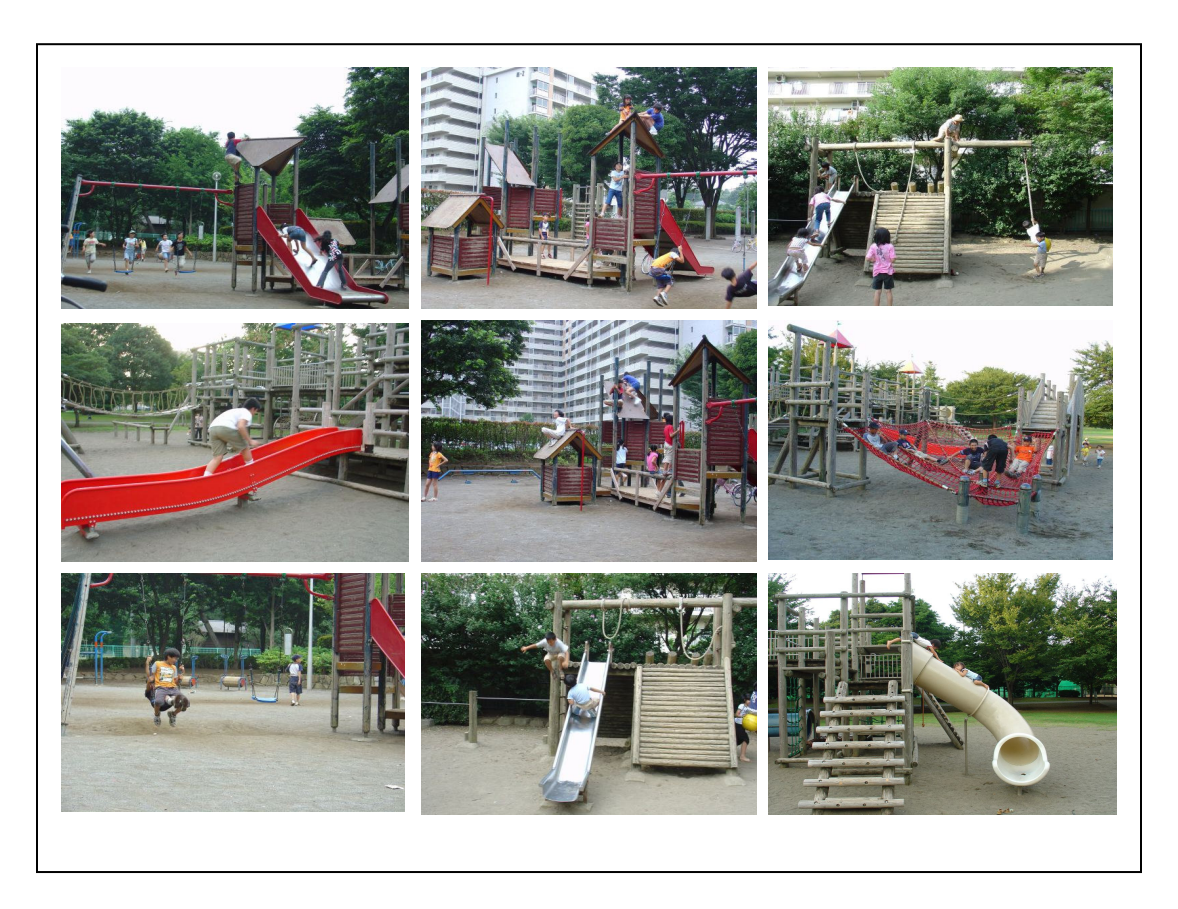
Figure 2: Children's activities at the equipments.

playground equipment was recorded. At the playgrounds observed children of different ages came to play. Usually during weekdays when the weather was fine and was not too cold or too hot, the first user group were very young children around 2 or 3 years old accompanied by their mothers. Sometimes in weekends they were seen with their fathers. When the young children played with the equipment and they were with their parents unusual activities were not seen. The usual activities seen included sliding, swinging or climbing up the equipment at the structure, and at some playground playing in the sand play area. The other user group was children of elementary school years or older preschools kids around 6 years old or older. They came to playgrounds mostly in the afternoon hours. When these older children were playing at the playgrounds some interesting activities were seen. The figure and table below show the activities of the children using the play equipment (figure 2),(Table 6).