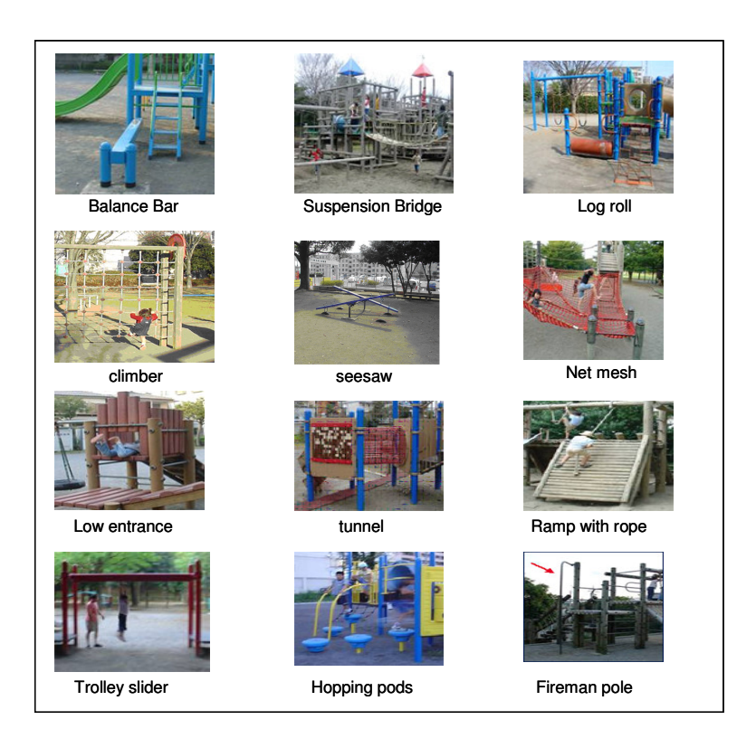
Figure 1: Some of the play equipments at Chiba city.

Some of the equipments that have been named in this section are shown in the following figure.